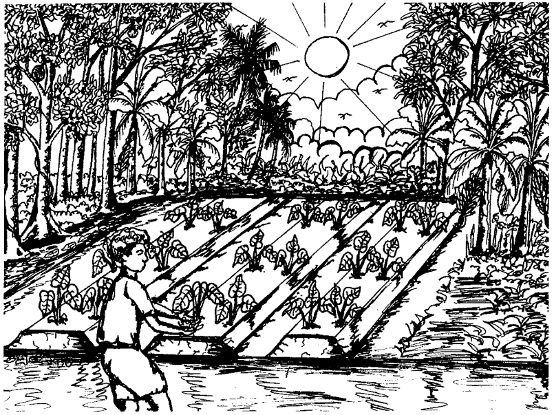
Raised beds can be used for vegetables, bananas and root crops such as taro.